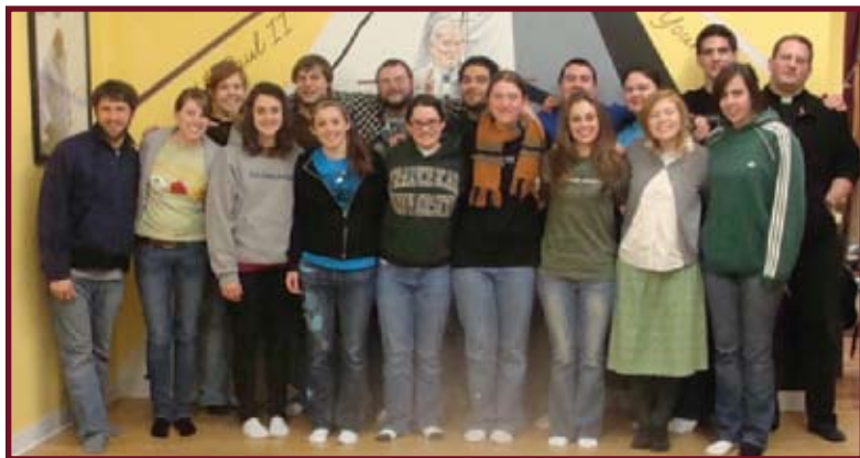
Snowball Missionaries from University of Steubenville in our JP II Youth Center

Throughout the week, the mission team performed a