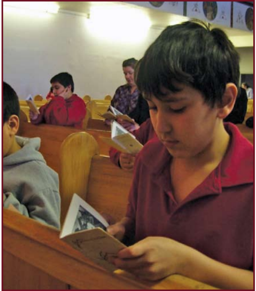
St. Ann's students in Chapel