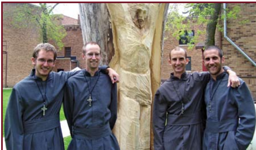
SOLT Bothers in formation visiting St. Ann's during the month of June.