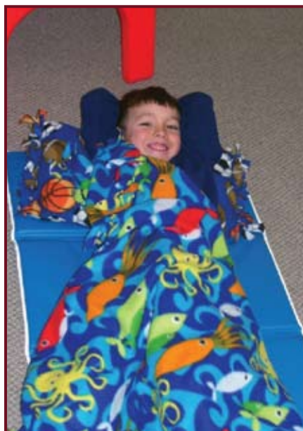
One of St. Ann's Kindergarten students during nap-time.