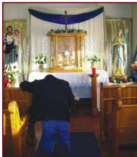
An adorer in the Chapel.