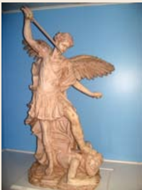
St. Michael the Archangel Feast Day: September 29