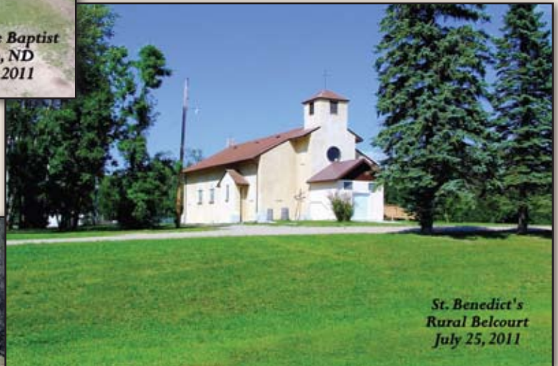
St. Benedict's Rural Belcourt July 25, 2011