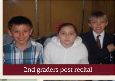
2nd graders post recital