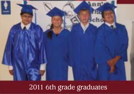
2011 6th grade graduates