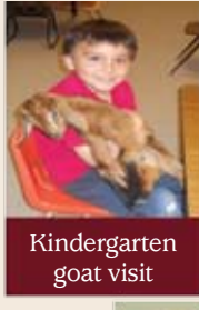
Kindergarten goat visit