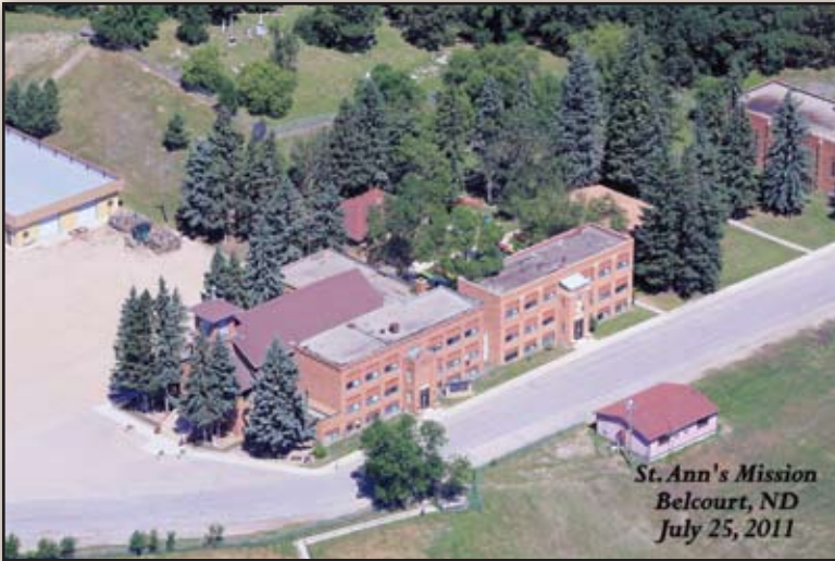
St. Ann's Mission Belcourt, ND July 25, 2011