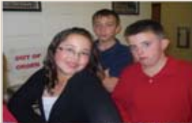
Spring field trip