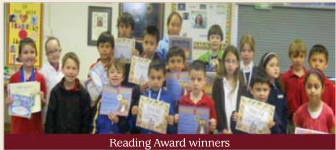
Reading Award winners