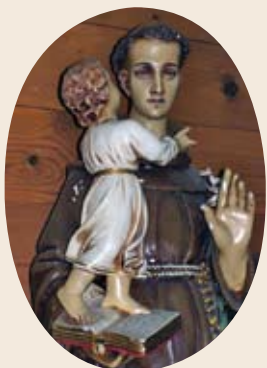
St. Anthony of Padua Feast Day: June 13