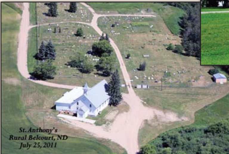
St. Anthony's Rural Belcourt, ND July 25, 2011