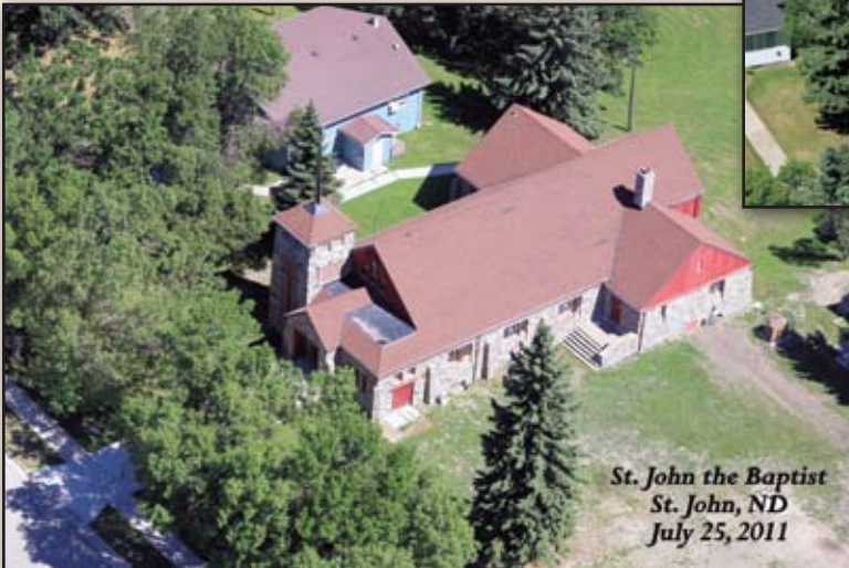
St. John the Baptist St. John, ND July 25, 2011