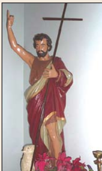
St. John the Baptist Feast Day: June 24th