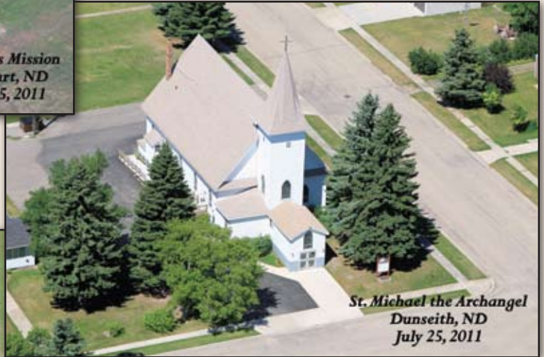
St. Michael the Archangel Dunseith, ND July 25, 2011