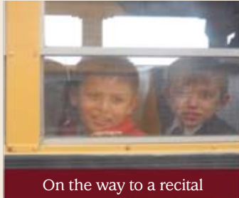
On the way to a recital