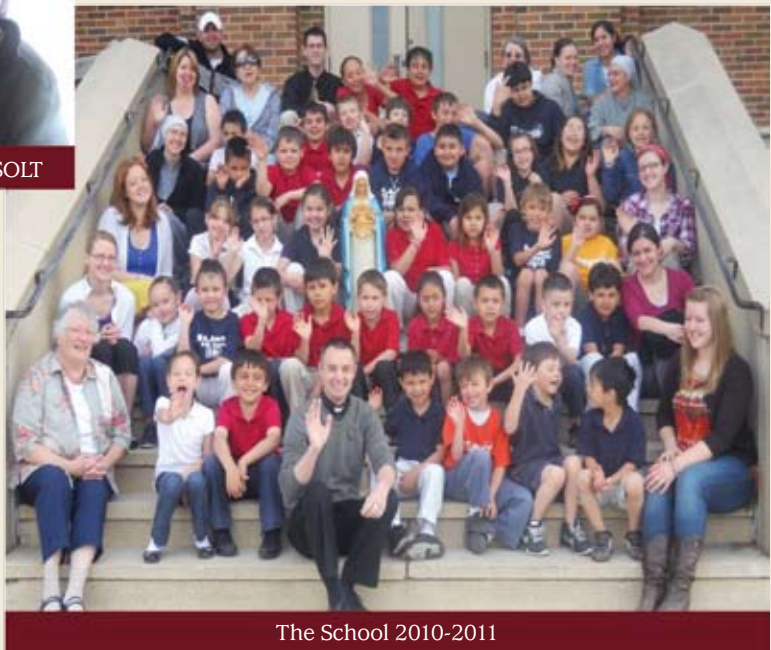
The School 2010-2011